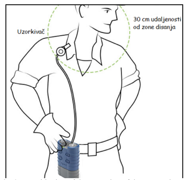
Fig. 2. Positioning of the extension of the personal sampler during sampling

Sampling is realized by setting up a continuation of the personal sampler within the first zone, i.e. the cyclone attachment is positioned in the breathing zone of the dentist. The breathing zone includes the space around the dentist's face from which he takes air, and it is a general recommendation that it does not extend more than 30 cm from the mouth (Figure 2).