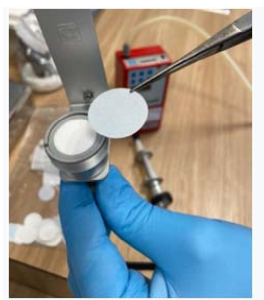
Fig. 4. Aerosol sample filter